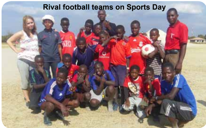
Rival football teams on Sports Day

MAC has recently agreed to provide six months financial support for the Trust school to start teacher training, establish some income generating activities and help coordinate a sustainability plan.